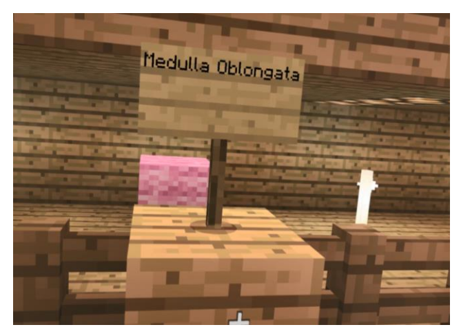
Figure 2: Screenshot of part of the legend at the base of the model indicating the type material used to represent different parts.