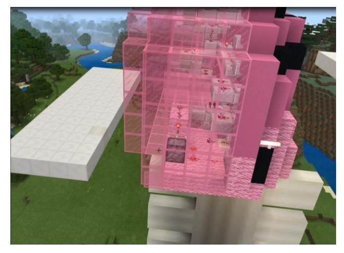
Figure 3: Screenshot of transparent (left) and solid (right) halves of the model