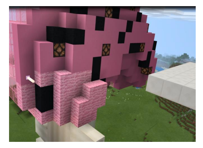
Figure 6: Screenshot of the sold half of the brain with pale pink 'wool' representing the medulla region.

It's incredible. That's all you can say. They are talking at levels that are far beyond...the Stage 5 syllabus (the expected curriculum level), their understanding of it. The fact there were no notes (used during the guided tour) really showed not only do they have deep learning, but throughout the process where they have collaboratively problem-solved, they actually are having to have discussions where they have taught each other...as a teacher that's one of those fuzzy feelings that gets you through some of the more difficult times because... these kids got this (learning) experience and they are taking that away. They will be able to communicate that to other people in the outside world and that is ultimately the main goal.