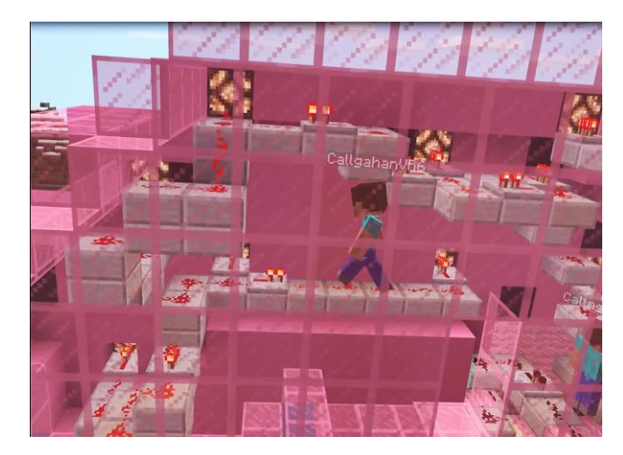
Figure 4: Screenshot showing student avatars in transparent side view of brain.