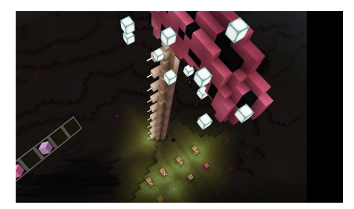
Figure 1: Screenshot of brain from above at night.

The brain itself was cleverly designed in two halves (Figure 3). One half was of transparent to show how certain functions within the brain, such as how neurons, worked. The students, who were knowledgeable about the engineering properties of Minecraft, added a 'T flip flop' circuit switch to the spine that they could turn off and on – they stated that this switch 'represented stimuli' which activated the 'neurons' in the brain. The impulses of the neurons were represented by the electrical dust called 'Redstone' which was regulated by 'repeaters' (the twin torch like material) (see Figure 4 and Figure 5).