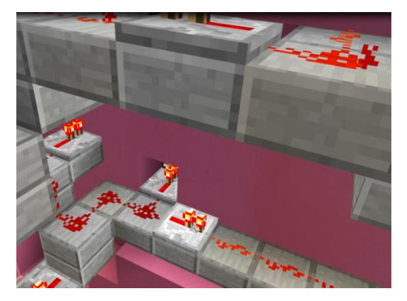
Figure 5: Screenshot showing close-up interior of transparent side of brain with Redstone 'neural impulses'.

At the conclusion of the unit of work, students took the teacher and researcher on a guided tour in VR. The tour was approximately 15 minutes in duration. During this time the students articulated detailed, accurate explanations of the parts and function of the brain and spine from memory . They did this unaided by notes or annotations (except for the simple legend at the model's base). During the tour, the researcher and the teacher asked questions designed to gauge comprehension and application of knowledge. The following transcribed extract of the tour illustrates a high degree of content mastery, as the students answer probing questions while in VR: